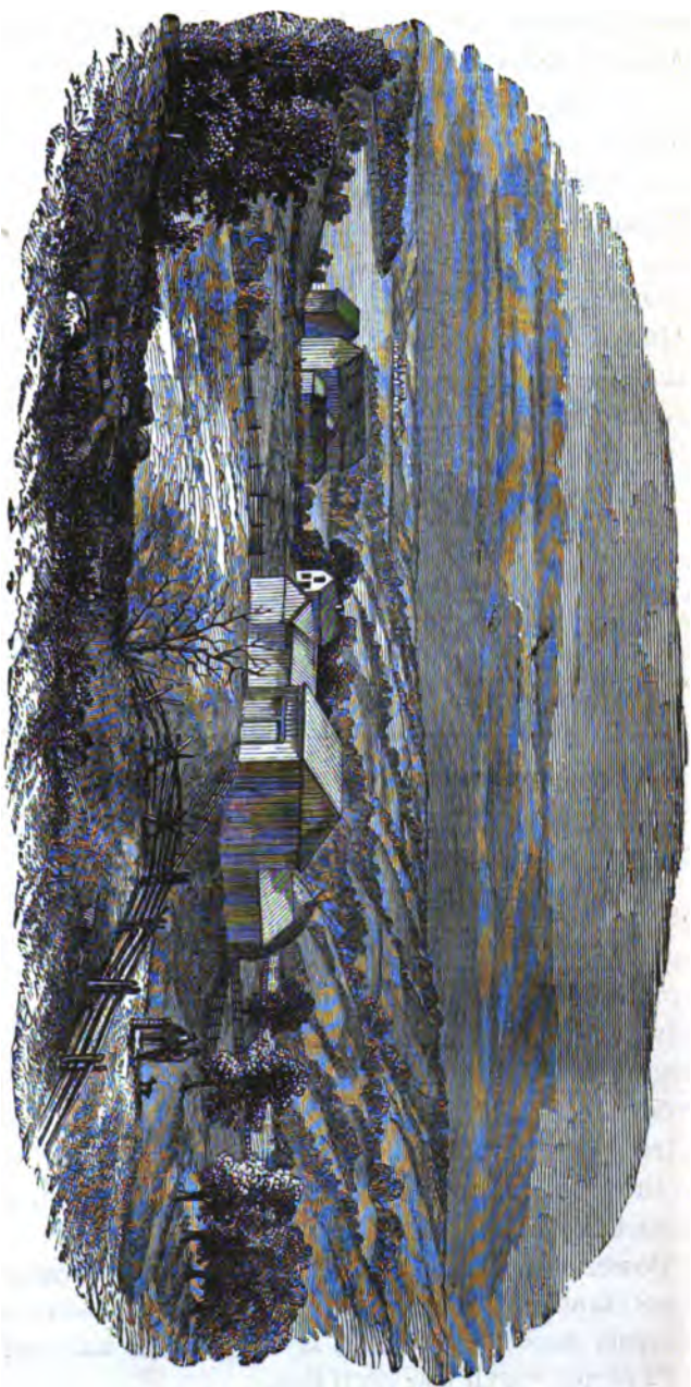
CONESTOGA LAKE. LOOKING NORTH FROM THE HEAD.