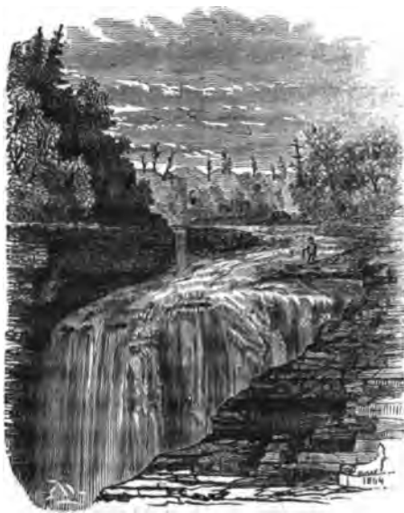
LOWER FALLS AT PORTAGE.

can be seen, in a ruined condition, in passing over the line of the canal,—a dark, half-ruined cavern in the crumbling rock, and the lasting depository of the people's money, squandered in a foolish struggle with Nature. But though baffled here, the engineer did succeed in pinning the canal to the treacherous side of the towering mountain, and his work is well worth a long visit to see. The hill rises quite abruptly to the height of several hundred feet. A long distance below, in a chasm with almost perpendicular sides, is the Genesee, encircling the base of the hill and hurrying along over the rapids or madly leaping down the upper and middle falls. Half way up the precipitous