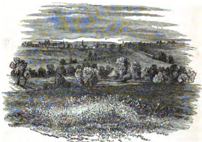
SITE OF BIG TREE VILLAGE, MONTURE'S GRAVE IN FOREGROUND.

to Cuylerville, crossing the bed of the stream at right angles. Two apple-trees, planted by the Indians are still in bearing. They stand across the gully at the north-east, and point the spot where the orchard was located. Before the canal was dug, Colonel Lyman occupied a store-house on the river just east of Big Tree village. The river for some distance is very crooked here. In an air line North's mill is but a mile and a half below, but measured by the river's channel, it is quite seven miles. The graves of John Monture, and four other Indians occupy a spot never yet plowed, represented by the turfy hillock in the engraving,