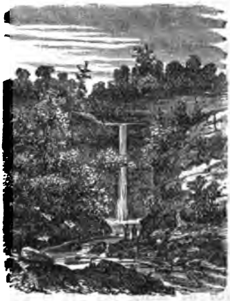
FALL BROOK, GENESEO.

Another version refers the occurrence to a period nearly a century anterior to the latter date, connecting it with the French invasion, under De Nonville, in 1684, of the Seneca villages in the Genesee country. It is likely that the tale has its origin in the destruction of a small band of De Nonville's army, which the Indians, familiar as they were