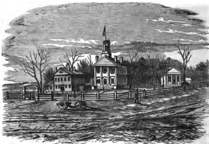
COURT-HOUSE, JAIL AND CLERK'S OFFICE, GENESEO— TAKEN SOME YEARS AGO.

The town expenses, in early times, were very moderate. In 1798 the sum of twenty dollars was deemed