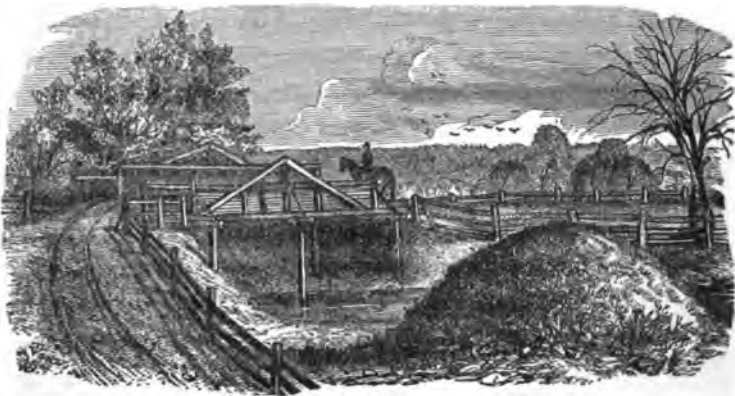
BURIAL PLACE OF BOYD AND PARKER.