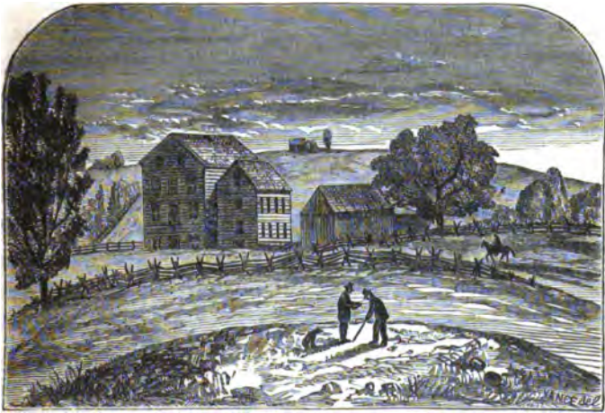
SITE OF FORTIFIED TOWN NEAR BOSLEY'S MILLS.

The names of the various places already described have passed into oblivion. We are a little more fortunate as respects another work of the same class at no great distance from those mentioned. It was