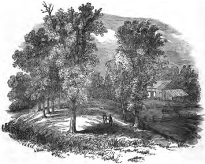
SITE OF TUSCARORA BURIAL PLACE NEAR MAJOR SPENCER'S.

The village of the Tuscarora Indians, O-ha-gi, † lay a mile north of the Big Tree town on the same side of the river. Its site was a gentle swell of land rising westward from a marshy flat, some thirty rods south of Spencer's warehouse. The canal passes through the old Indian town, on the easterly border of which are yet standing two apple-trees planted by the natives. A spring of slightly brackish water which supplied the village, and around which the houses clustered, is still in use. Generals Poor and Maxwell, under orders from Sullivan, destroyed the town in 1779, and