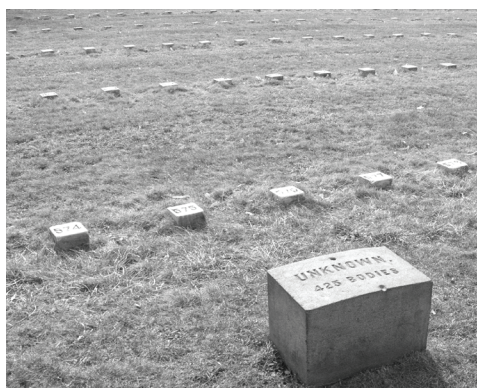
An Unknown section marker and unknown grave markers behind it.