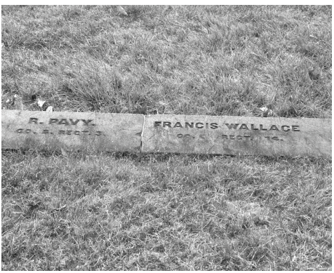
Two regular grave markers in the Indiana section.