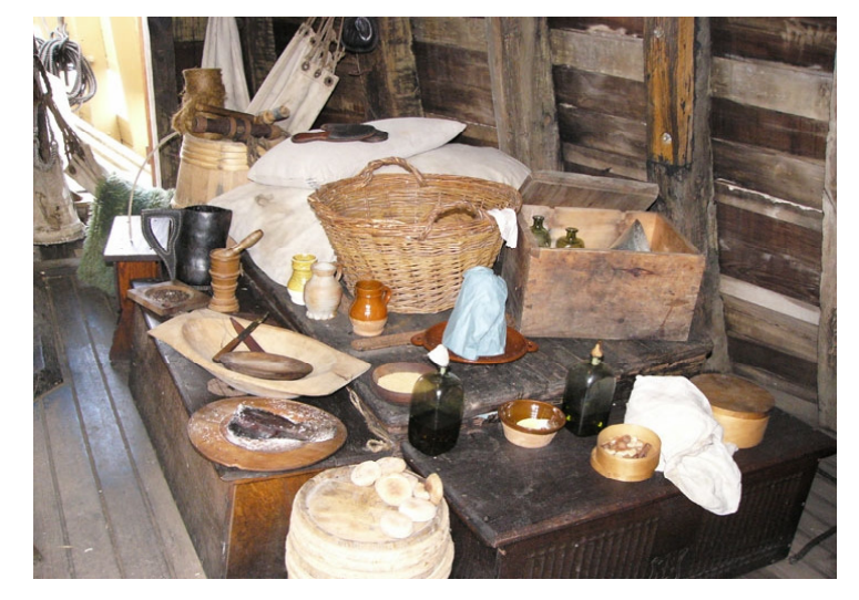
The Pilgrims Dinning Area