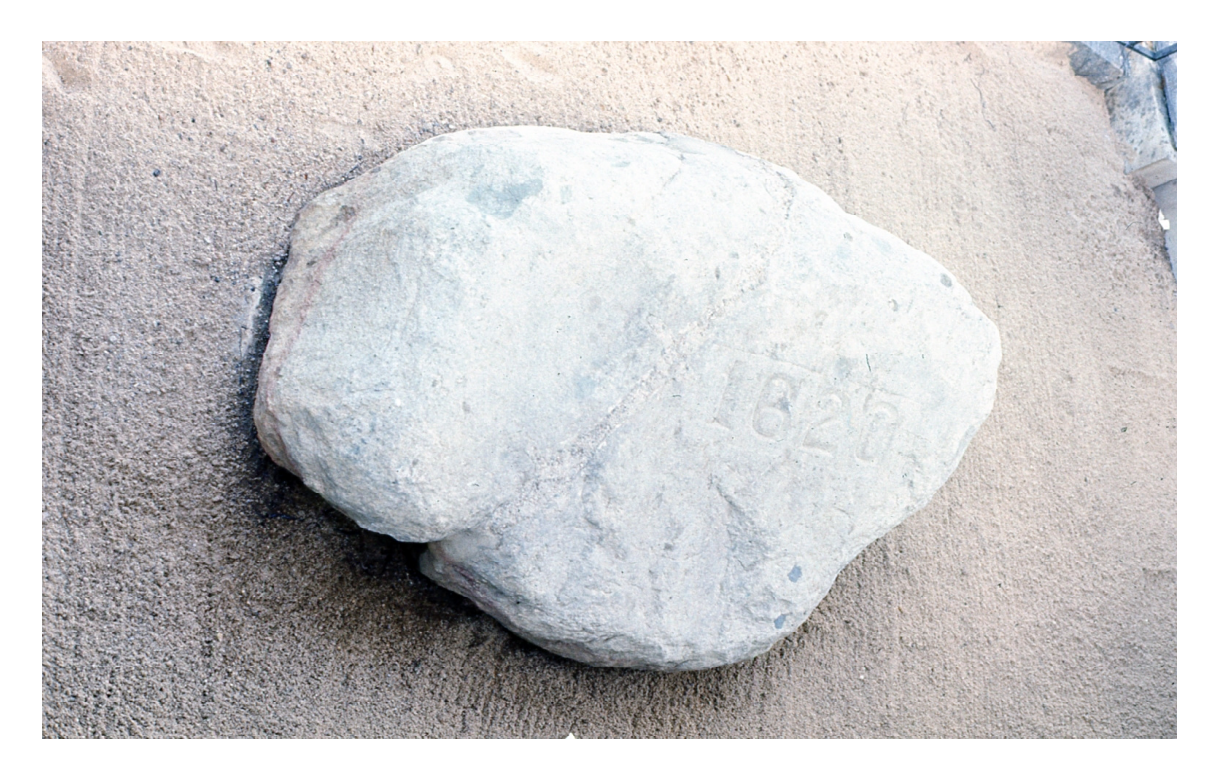
\mathsf{Plymouth}\ \mathsf{Rock}\ \text{-}\ \mathsf{Where}\ \mathsf{it}\ \mathsf{is}\ \mathsf{thought}\ \mathsf{the}\ \mathsf{Pilgrims}\ \mathsf{First}\ \mathsf{Stepped}\ \mathsf{Ashore}