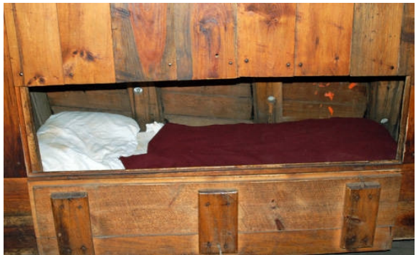
A Ship Officer's Bed